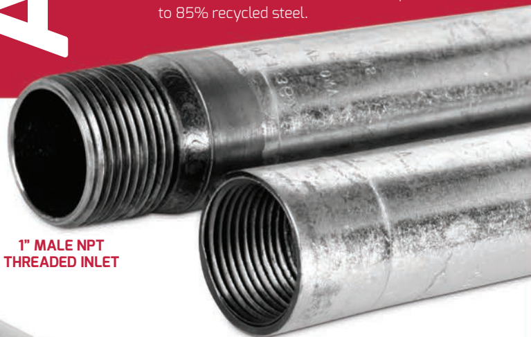
1" MALE NPT THREADED INLET