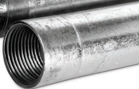
1" FEMALE NPT THREADED INLET